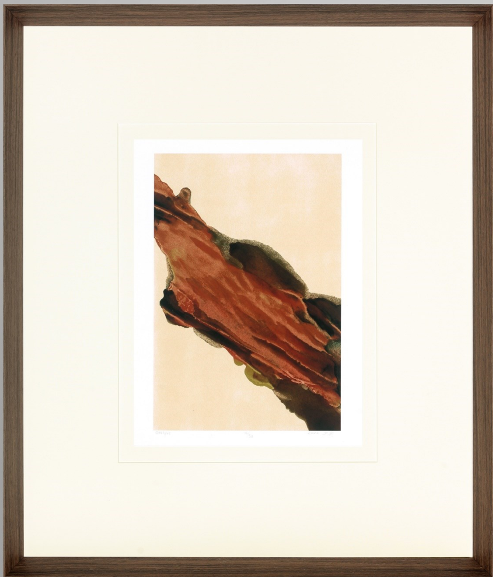
CHA 001 : 65X75 cm