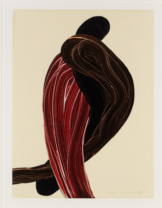
CHA 017 : 65X75 cm