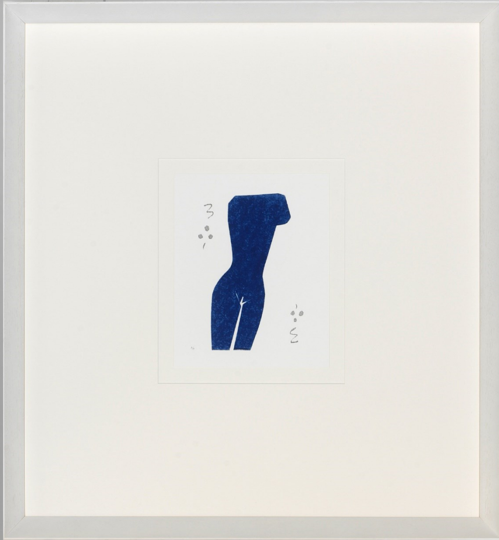
X 522 : 65X70 cm