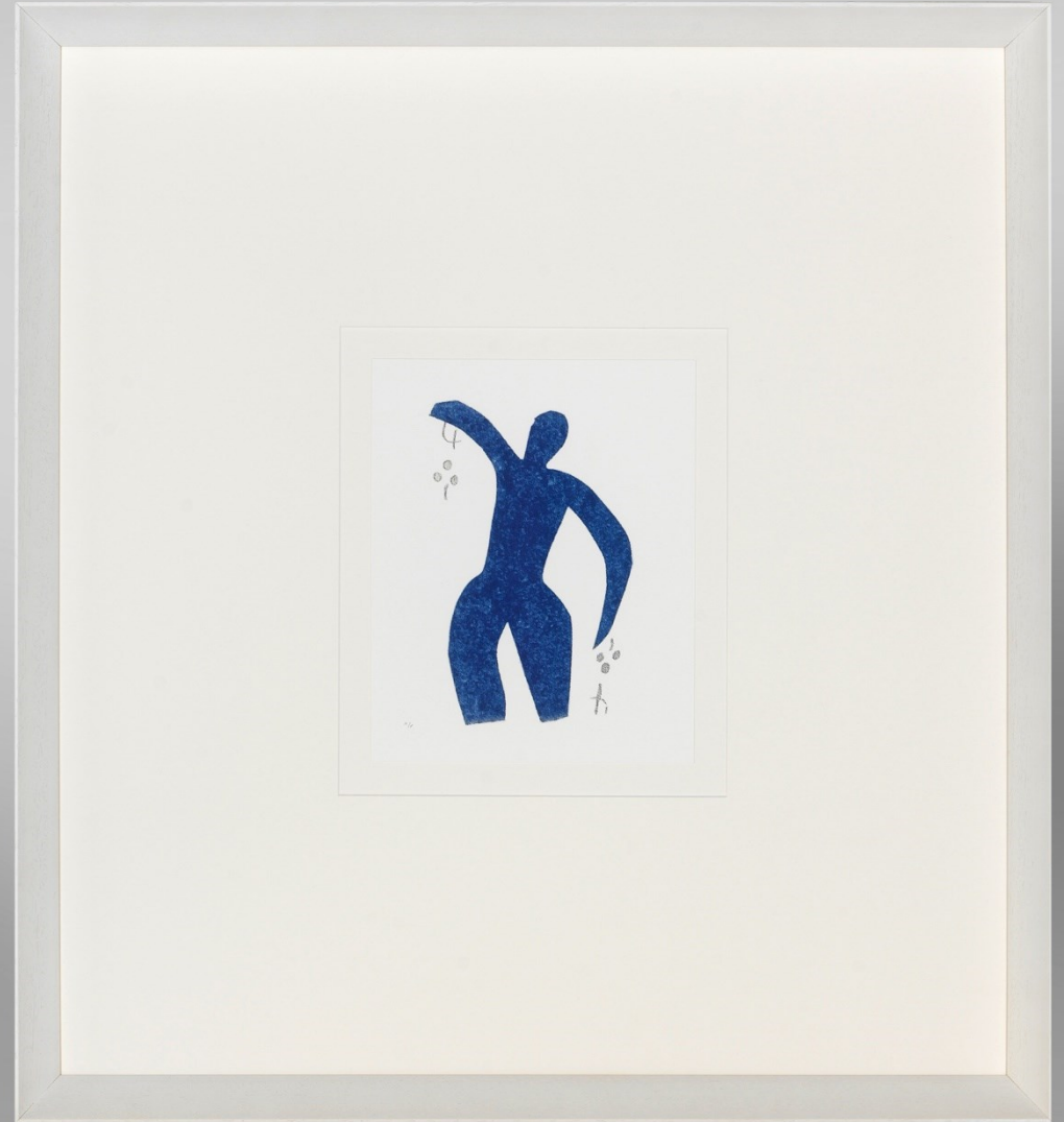
X 523 : 65X70 cm