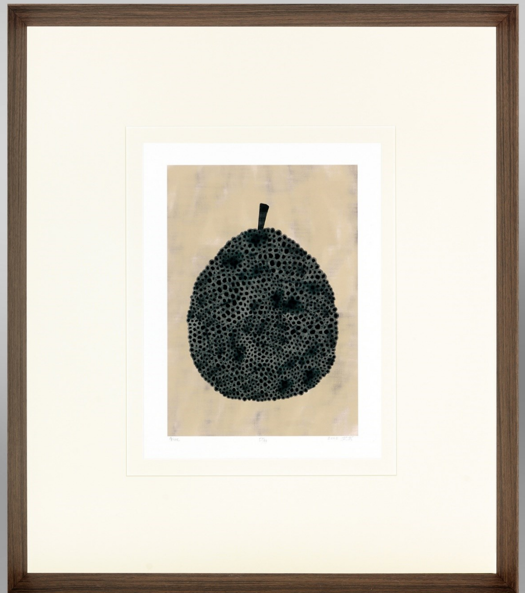
CHA 004 : 65X75 cm

Exclusive Limited Collection (max. 99 pcs)