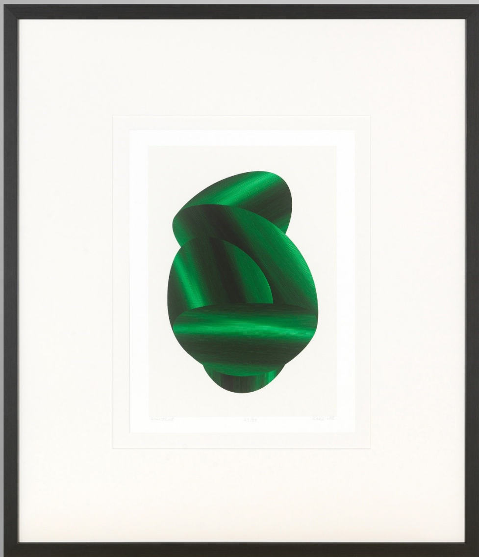
CHA 013 : 65X75 cm