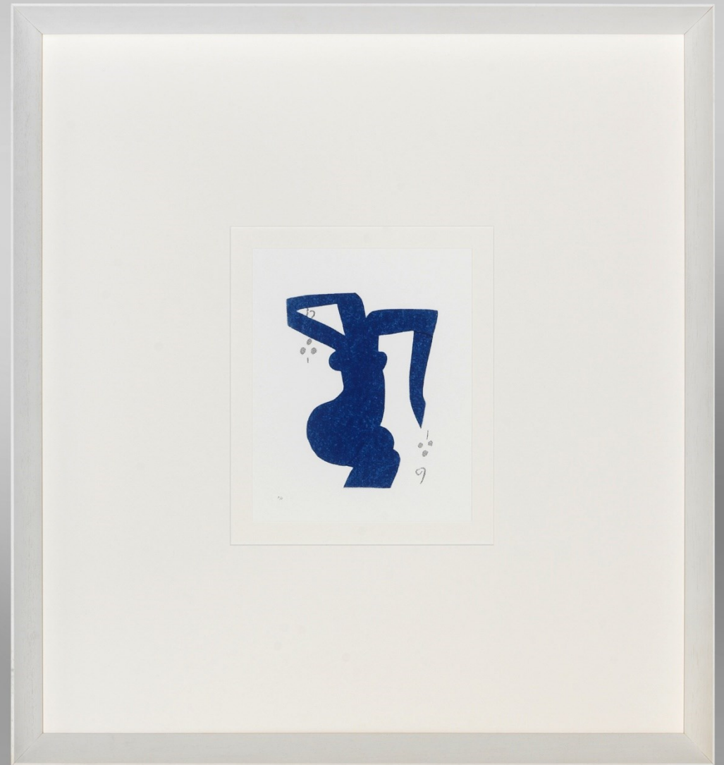
X 525 : 65X70 cm