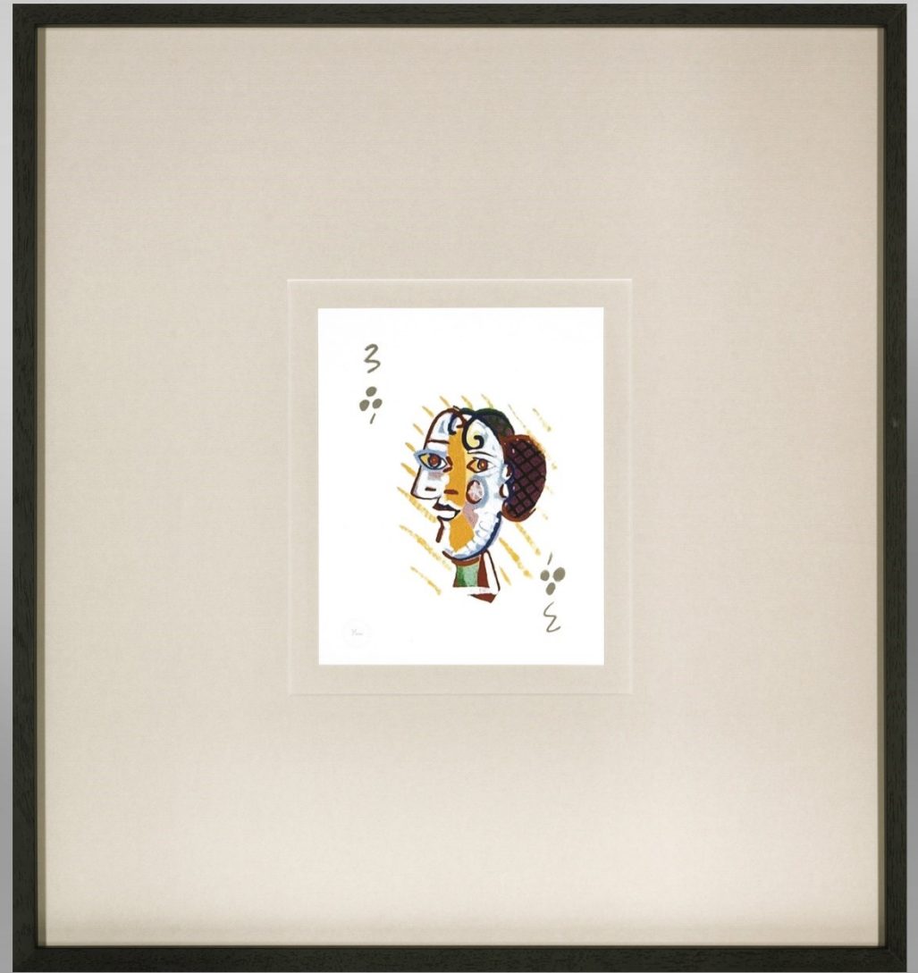
X 381 : 62x67 cm