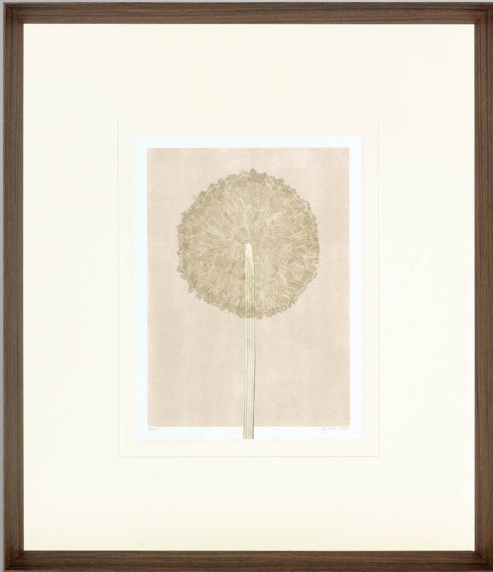
CHA 003 : 65X75 cm