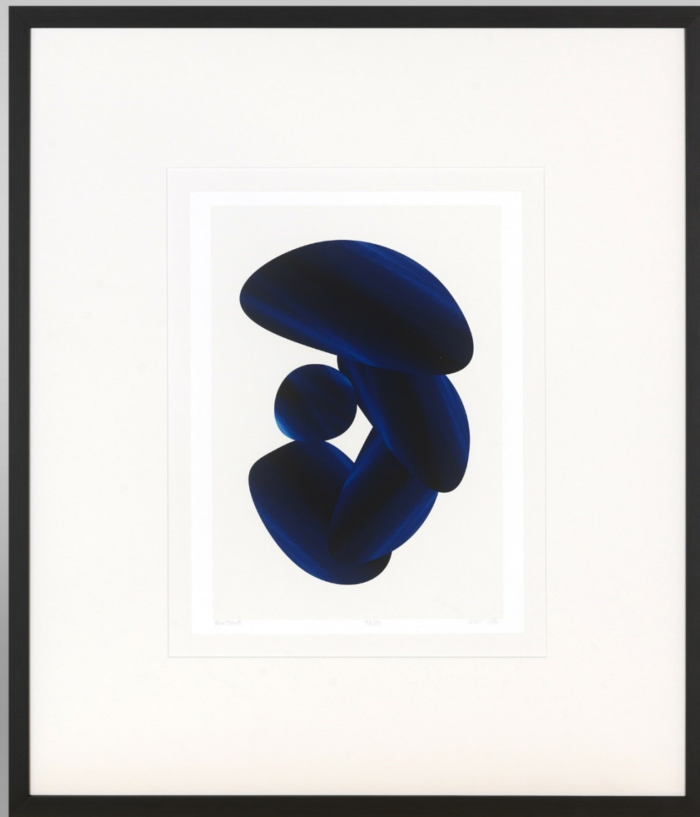
CHA 016 : 65X75 cm

Exclusive Limited Collection (max. 99 pcs)