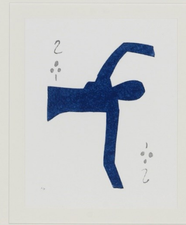
X 521 : 65X70 cm