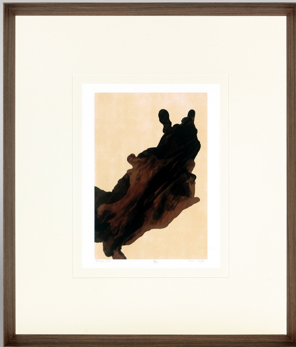
CHA 002 : 65X75 cm

Exclusive Limited Collection (max. 99 pcs)