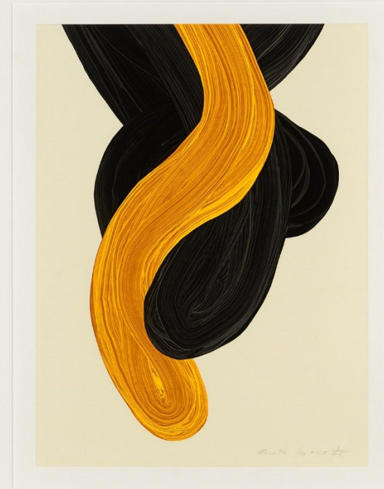
CHA 018 : 65X75 cm

Exclusive Limited Collection (max. 99 pcs)