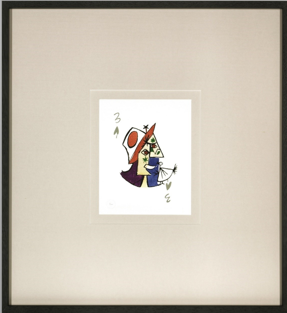
X 384 : 62x67 cm