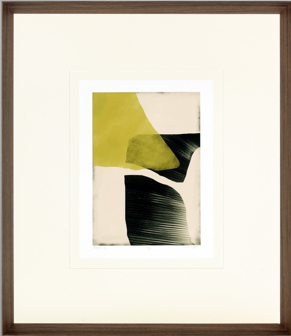
CHA 005 : 65X75 cm