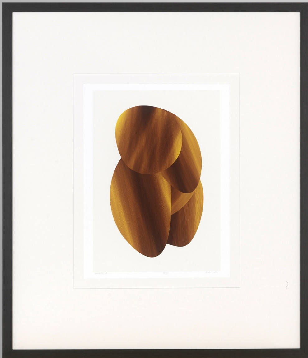
CHA 015 : 65X75 cm