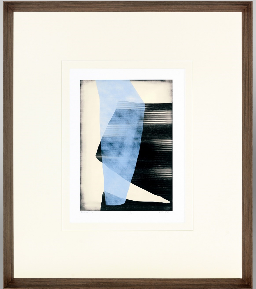
CHA 006 : 65X75 cm

Exclusive Limited Collection (max. 99 pcs)