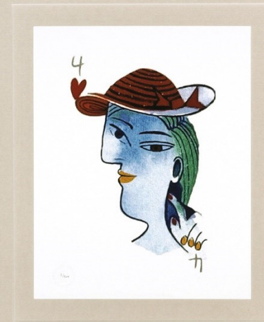
X 383 : 62x67 cm