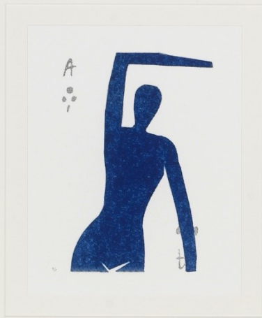
X 520 : 65X70 cm