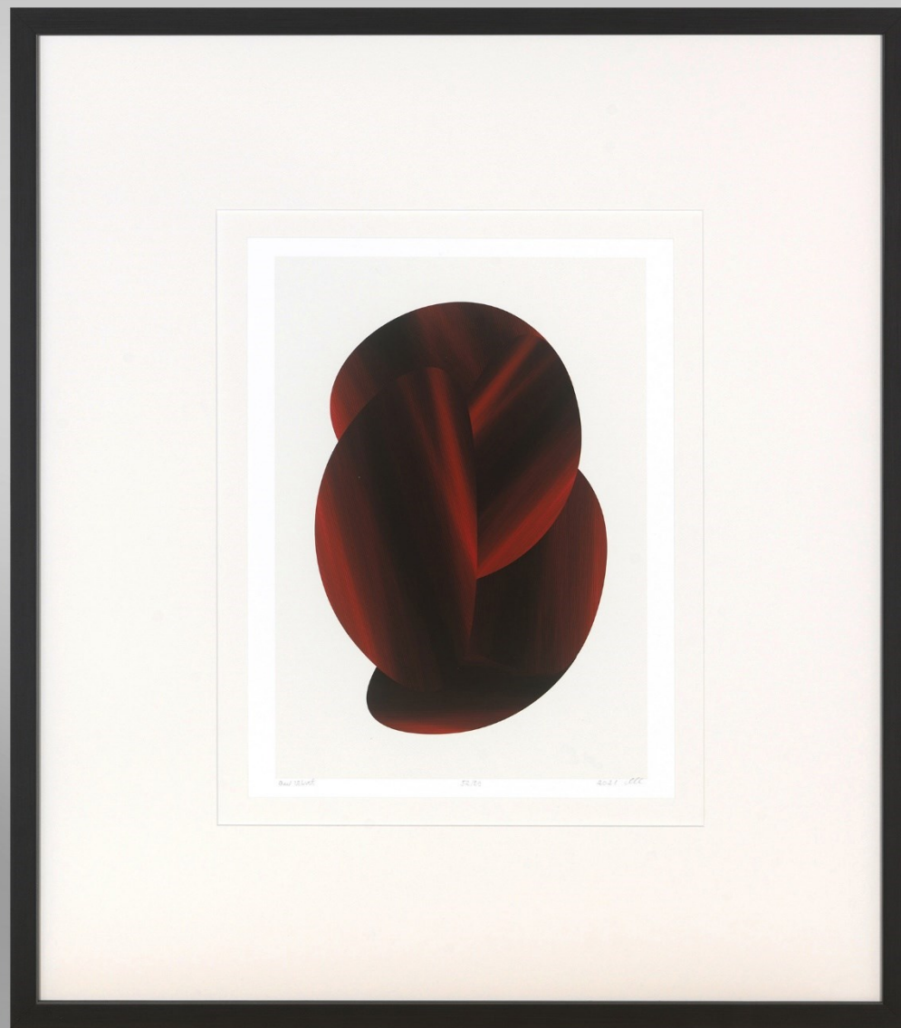
CHA 014 : 65X75 cm

Exclusive Limited Collection (max. 99 pcs)