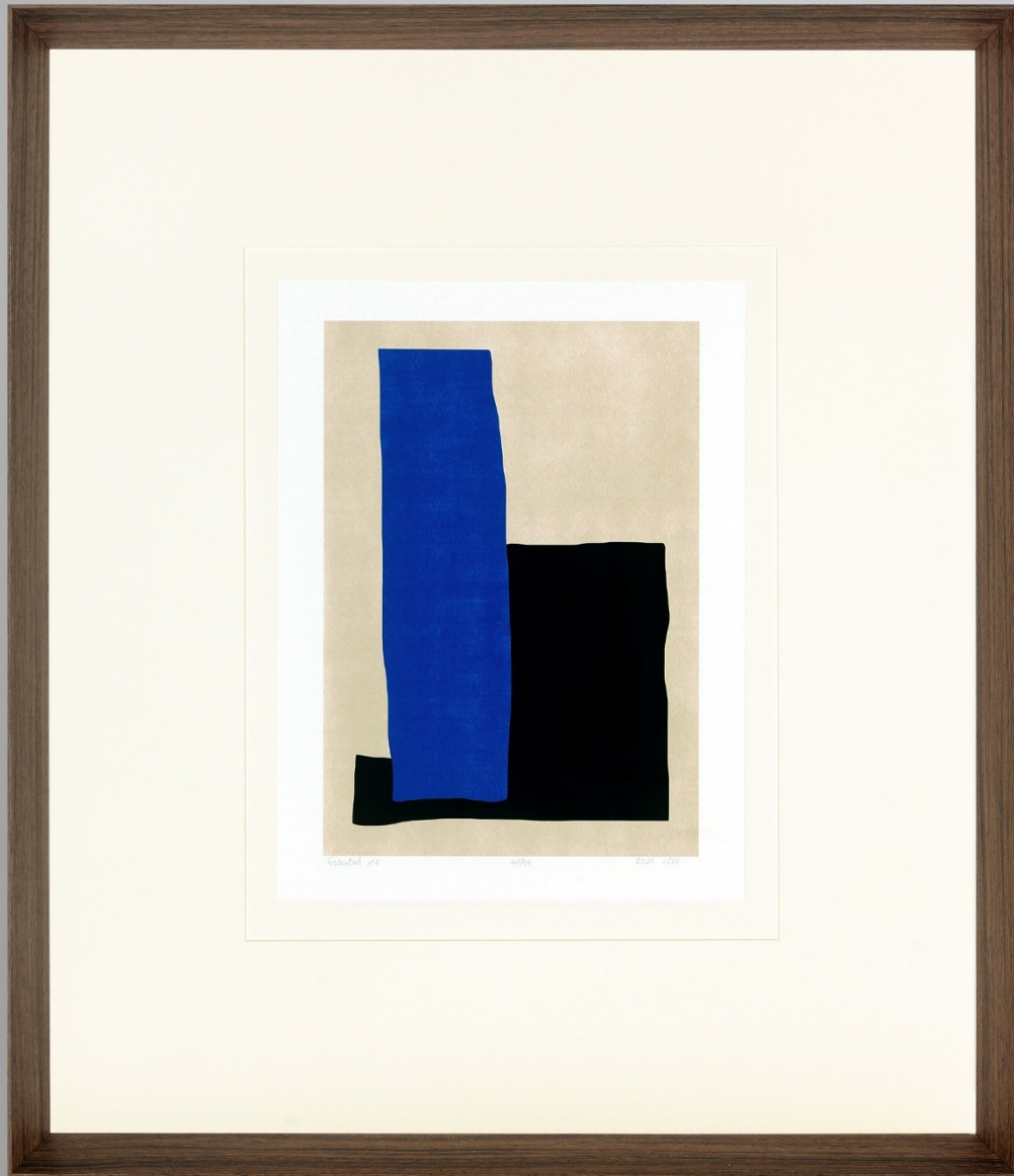
CHA 007 : 65X75 cm