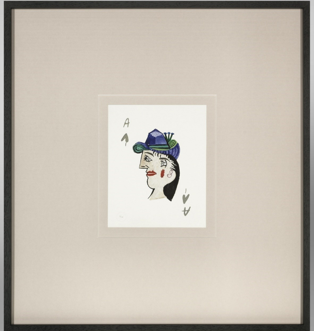
X 385 : 62x67 cm