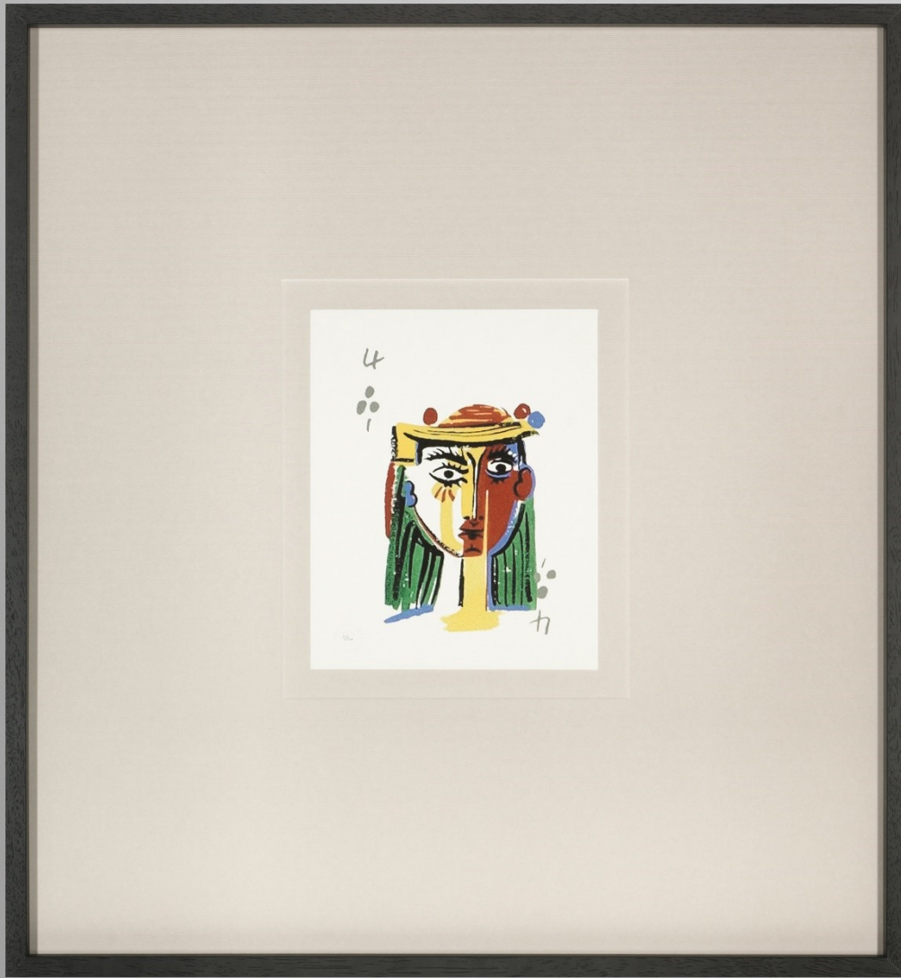
X 380 : 62x67 cm