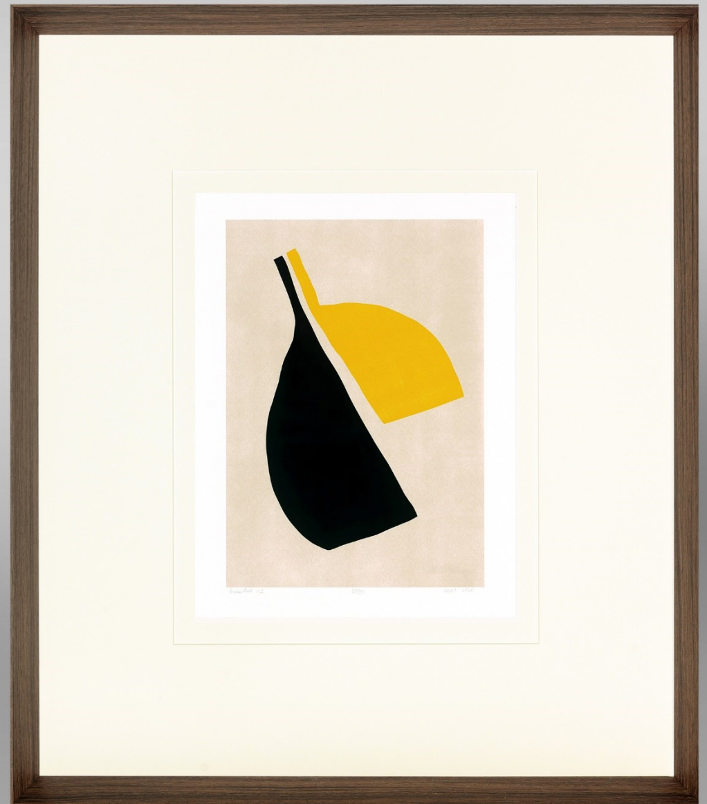
CHA 008 : 65X75 cm

Exclusive Limited Collection (max. 99 pcs)