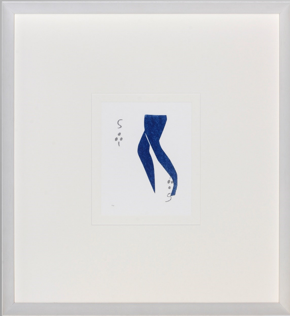
X 524 : 65X70 cm